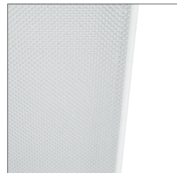
MP19H microprismatic diffuser