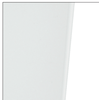
OP opal diffuser

All current index numbers, lumen outputs, power consumption and many other technical information are available in our 2024 pricelist. Details on wireless lighting control systems on page number 896.